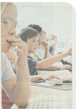
Supporting students' literacy is a high-profile campaign